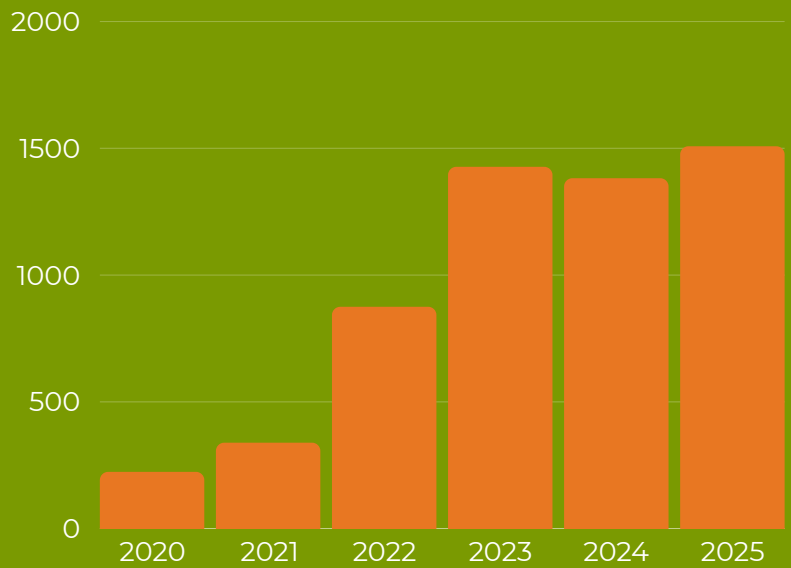
Growing Our Impact Camp Aldersgate Participants

100% of campers receive financial assistance